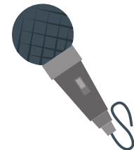
BGV (50% of lead)