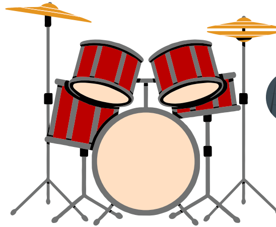
house kit (if applicable)